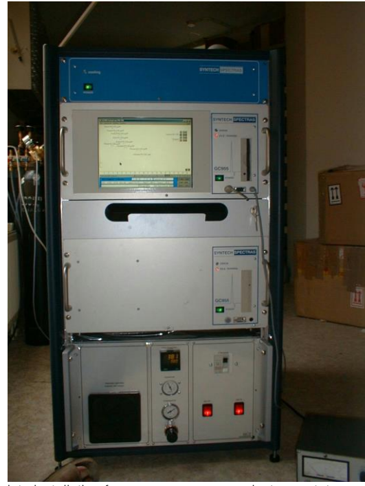
Complete installation for an ozone precursor instrument, two gaschromatographs, including gas supply

The Syntech Spectras solution is an analytical system consisting of two sample systems and two separate column systems: one for the C2-C5 and one for the C6-C10 fraction.