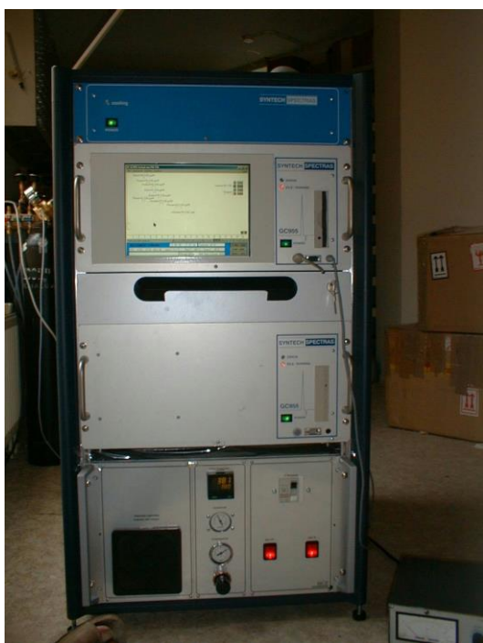
Complete installation for an ozone precursor instrument, two gaschromatographs, including gas supply

The Syntech Spectras solution is an analytical system consisting of two sample systems and two separate column systems: one for the C2-C5 and one for the C6-C10 fraction.